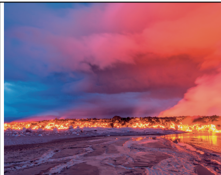
Hugðik Markelsson, 2016. Front page illustration: Egill Valdimarsson.

Unique Icelandic nature films shown daily